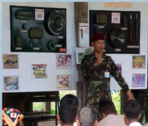
HMAU leads Mine Risk Education activity