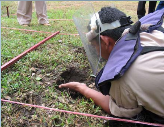
Deminer prodding in Sa Kaeo province, Thailand