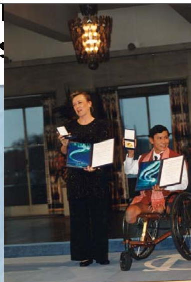
Jody Williams & Tun Channareth receiving the 1997 Nobel Peace Prize