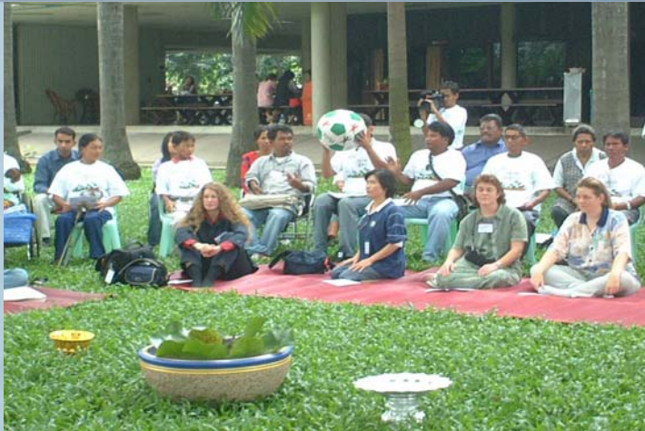
Landmine Survivors and ICBL participating in the 5MSP Interfaith Service September 2003 Bangkok Thailand