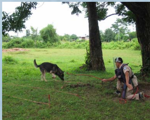
Deminer and dog in partnership Thailand