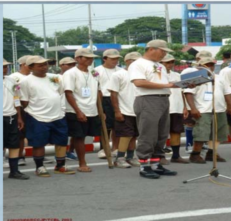
Stockpile Destruction Ceremony in Lopburi, Thailand April 2003